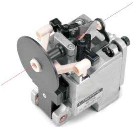
Short chromium spring brake